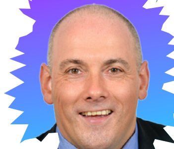
RT HON ROBERT HALFON MP FORMER SKILLS MINISTER | DFE