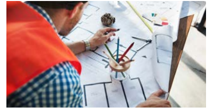
Custom Design & Engineering