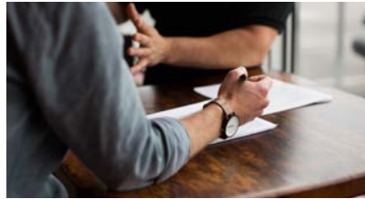
Consultation & Procurement

Because we are focused on providing the highest quality in every aspect to our clients, we have taken the initiative to become a Quality Management Systems certified company.