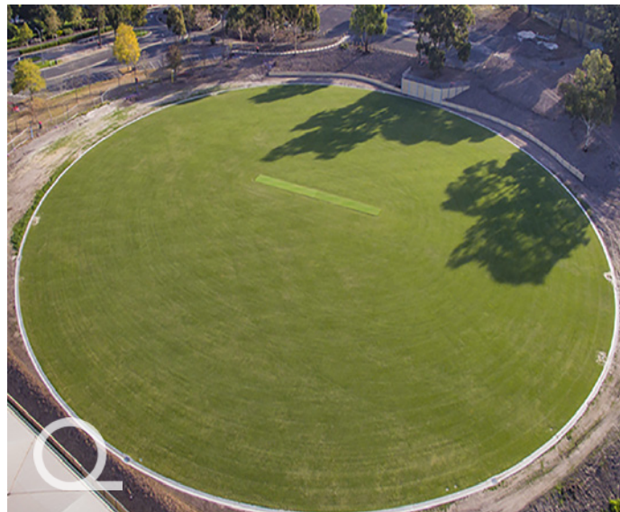
Ashes Oval - Salesian College Sunbury Campus VIC

Review a comprehensive range and case studies of completed sportsfield design and consulting projects on our website etpturf.com.au .