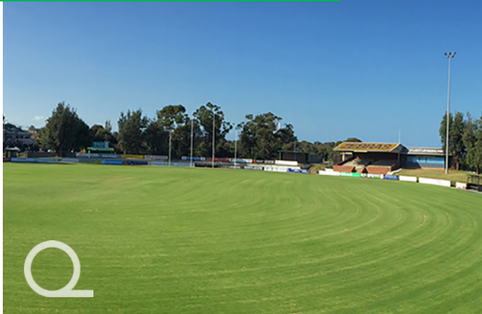
Trevor Barker Oval - Sandringham VIC