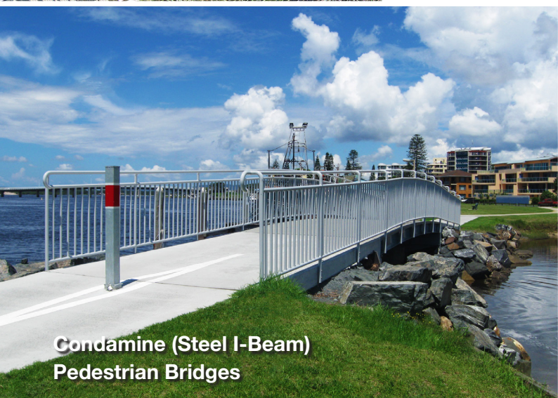
Condamine (Steel I-Beam) Pedestrian Bridges