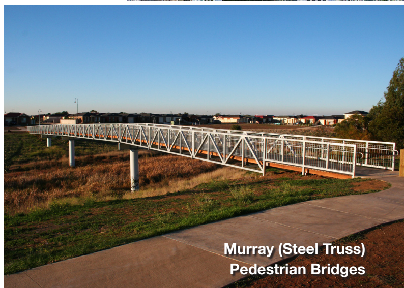
Murray (Steel Truss) Pedestrian Bridges

Landmark Products offers a complete, professional open space structure and furniture service throughout Australia and abroad.