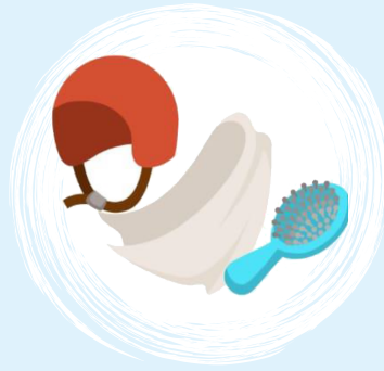
SHARING THE PERSONAL ITEMS