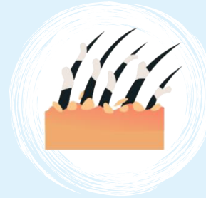
SORES & SCABS