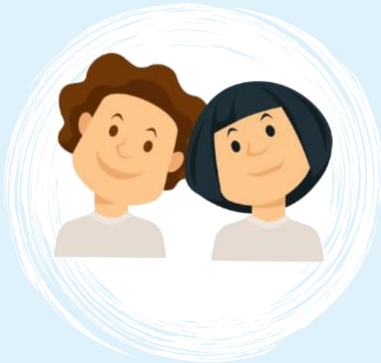
TOUCHING INFECTED HEAD