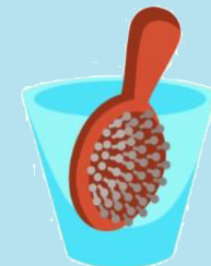
SOAK HAIR BRUSHES (90°)