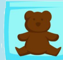
SEAL CLOTHES, BEDDING, AND PLUSH TOYS IN A PLASTIC BAG FOR TWO WEEKS