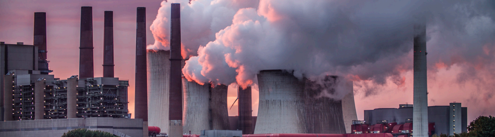
Figure 1: Our engagement expectations