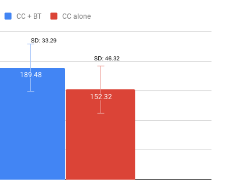
Figure 3: Initial evaporation time of Clear Care<sup>®</sup> with Biotrue<sup>®</sup> versus Clear Care<sup>®</sup> alone.