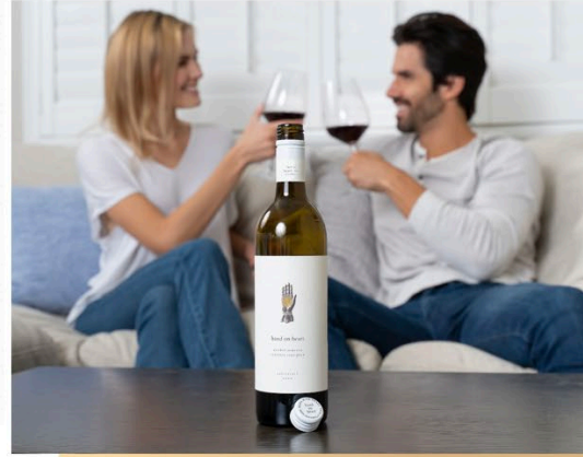
Full of Heart, Not Alcohol