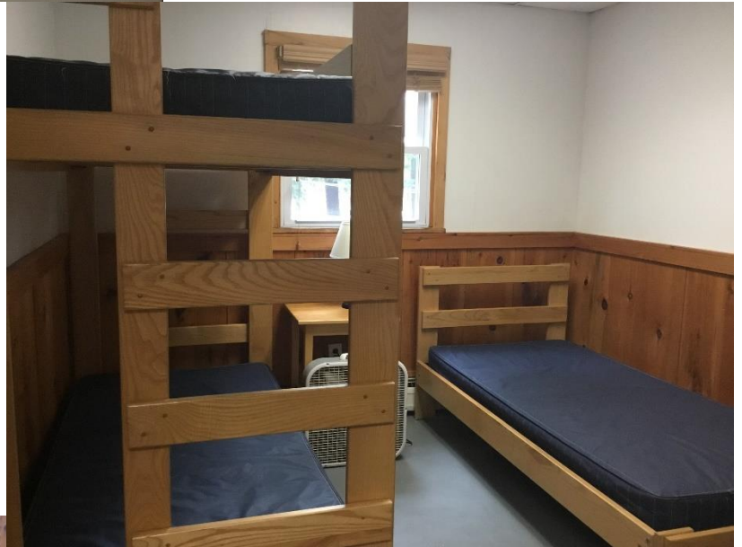
Sutliff Lodge, Boy's Side Room 2 (pictured left):

This room features 1 single bed and 1 bunk bed on the basement level of Sutliff Lodge. Room can be accessed through walk-out basement doors or by a set of stairs from the top level of the building and is directly across from a bathroom.