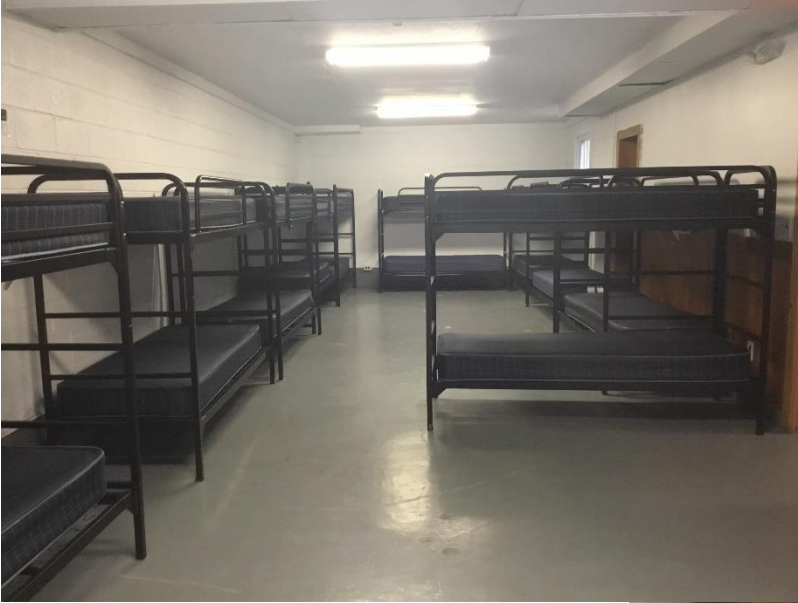
Sutliff Lodge, Boy's Side Dorm (pictured left):

This room features 13 bunk beds on the basement level of Sutliff Lodge. Room can be accessed through walk-out basement doors or by a set of stairs from the top level of the building.