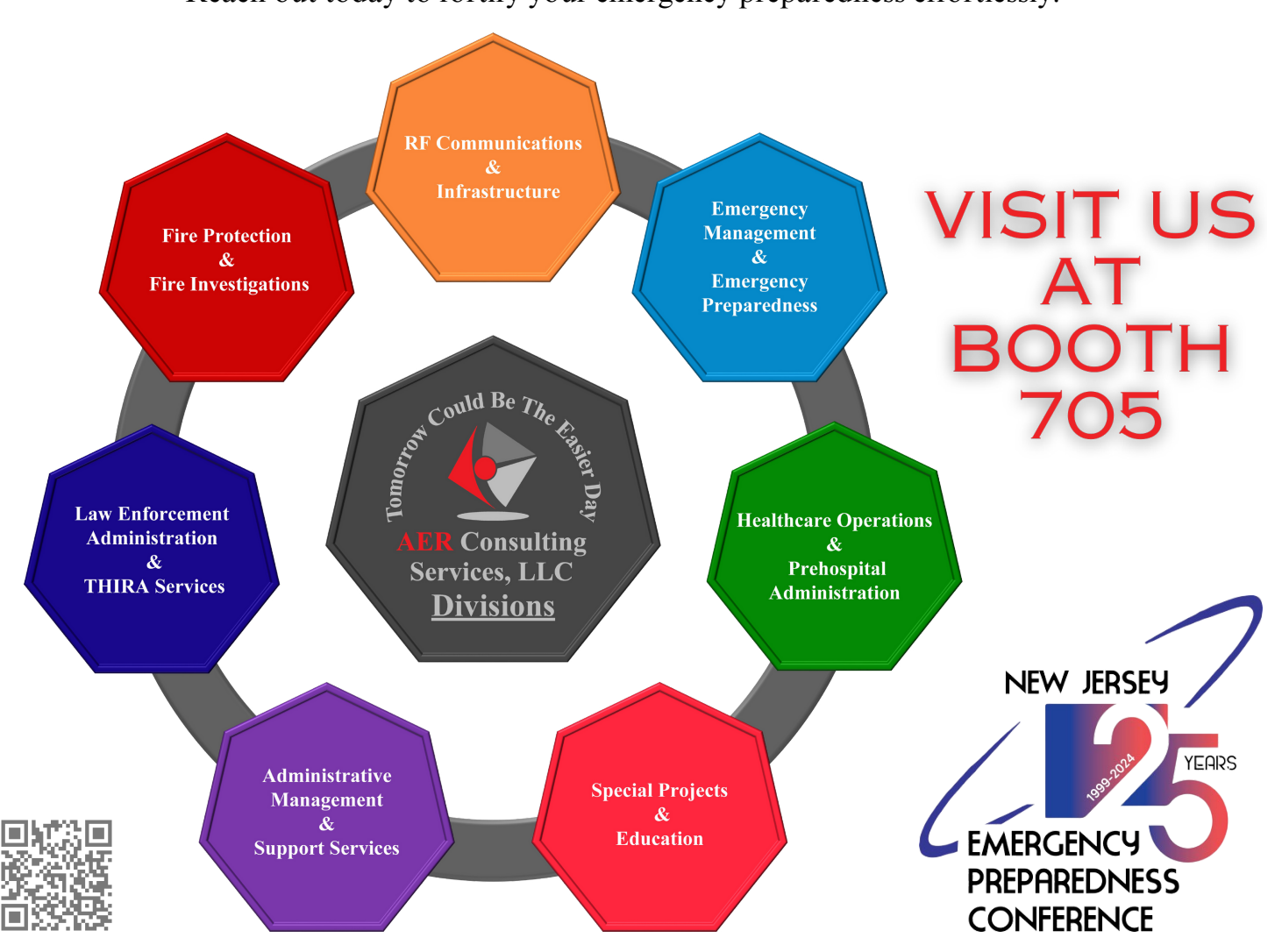
Trust A.E.R. Consulting Services, LLC to guide you through uncertainty with precision and care. Reach out today to fortify your emergency preparedness effortlessly!

We specialize in crafting customized Emergency Operations Plans (EOP) and annex templates, tailored to your organization's unique needs.