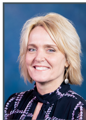
Margie Vandeven Commissioner of Education