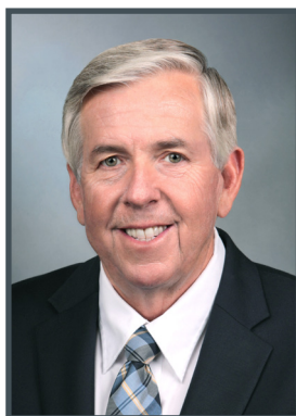
Michael L. Parson Governor